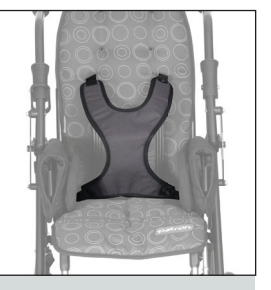
H-style harness CLASSIC