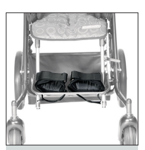
Feet fixation - pair