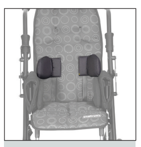
Side trunkrest CLASSIC