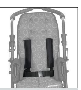
4-point immobilisation belt CLASSIC