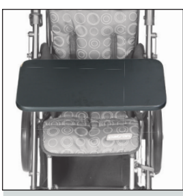
Work board BASIC - UNI