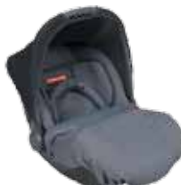
gento smoke grey (605)