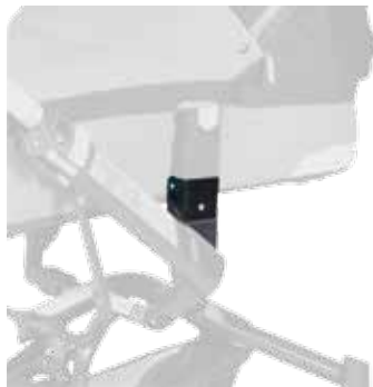
Carrycot height booster (AMIGO)