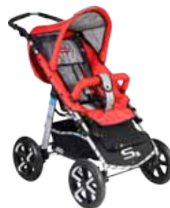
gunny red (580)