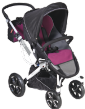
LAMBDA 4R + ERGO