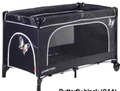
Butterfly black (844)

Version SKIPPY Plus - includes additionally as well as bassinet and mosquito net.