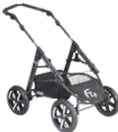
DELTA 4 chassis. Large four pneumatic wheels, excellent stability, suitable for outdoor activity.