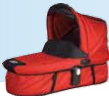
tweed ruby red (667)