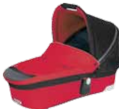
AMIGO carrycot. Extra large baby carrier, very light weight, comfort features.