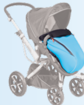
Winter foot-muff (ERGO)