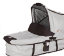
spirit silver grey (657)