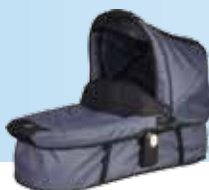
tweed indigo blue (668)