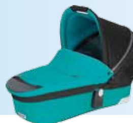
gento smaragd (634)