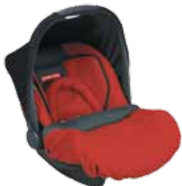
MIMMO PLUS baby car seat, light and compact design, fully equipped.