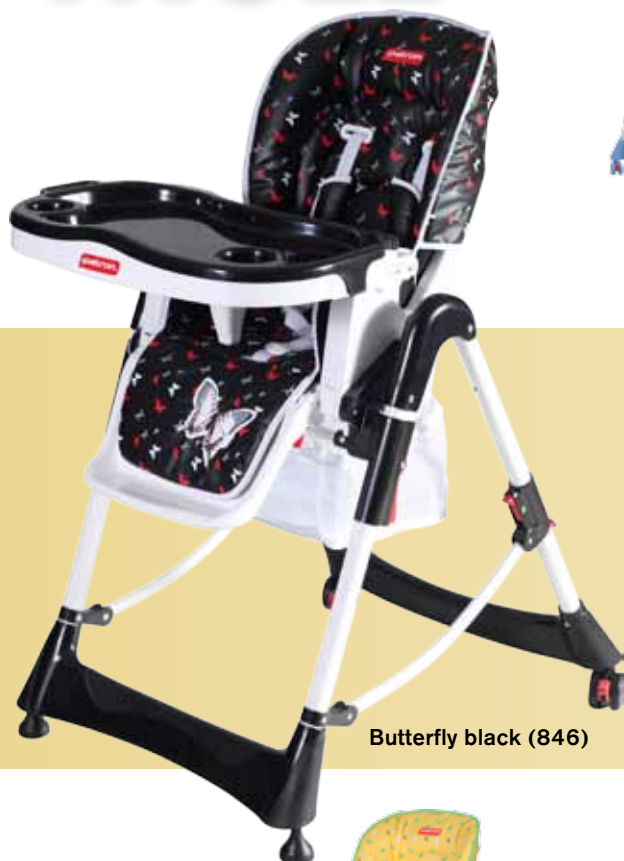
Butterfly black (846)