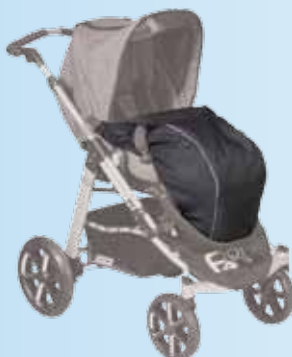
Winter foot-muff (VARIO)