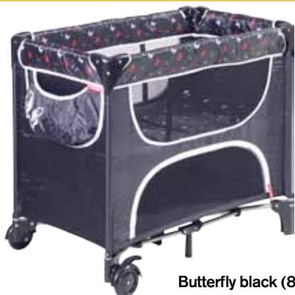
Butterfly black (845)

Standard equipment: Dense mattress, comfort upholstery, accessory compartment, pocket, transport bag, transport wheels, mosquito net with sun shade.