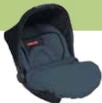
gento graphite (672)

Product corresponds to the newest EC standards and requirements as well as has been successfully crash tested according to ECE R44/04.