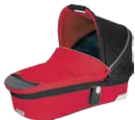
gento chilli red (628)