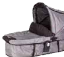
tweed smoke grey (662)