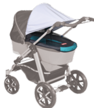
Summer accessory set (incl. summer carrycot cover addition, sun shade, pillow cotton cover)