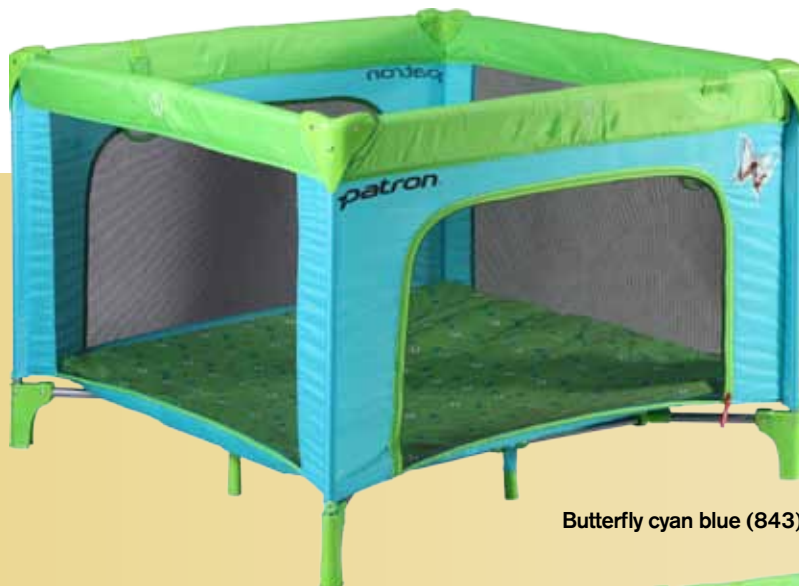
Butterfly cyan blue (843)

Play yard for indoor / home usage, offers light and compact folding design.