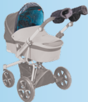
Winter accessory set (incl. winter carrycot cover addition, handlebar winter-gloves)