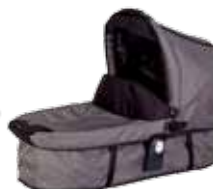
tweed stone grey (661)