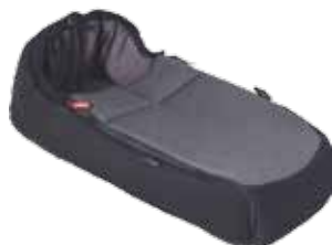
Winter baby nest (AMIGO)