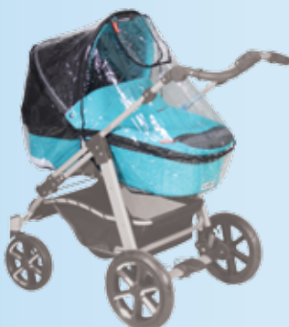
Rain cover (ERGO / AMIGO)