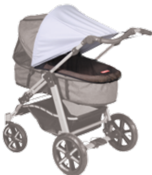
Summer accessory set (incl. summer carrycot cover addition, sun shade)