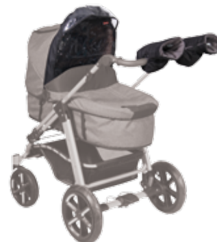
Winter accessory set (incl. winter carrycot cover addition, handlebar winter-gloves)