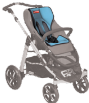
Seat inlay for small children (ERGO)