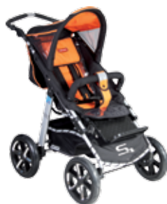
spirit orange (630)