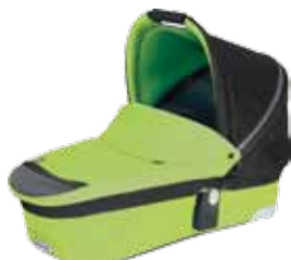
gento kiwi (602)