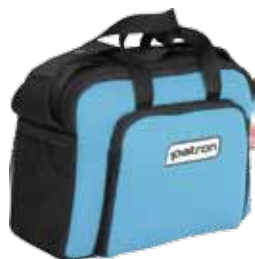
Mamabag STYLE Plus