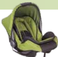
tweed lime (669)