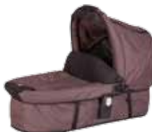
tweed tabasco brown (663)