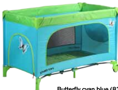
Butterfly cyan blue (836)