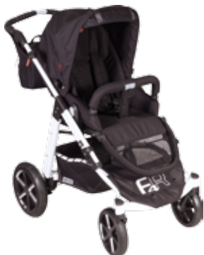
DELTA-4R + VARIO