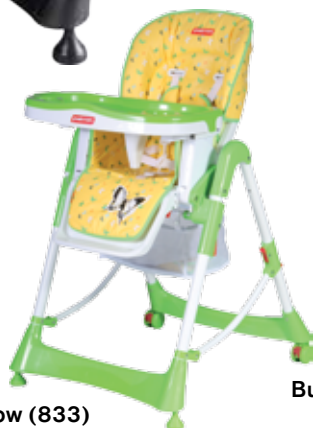
Butterfly yellow (833)