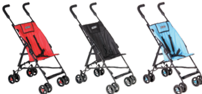
Ruby Red (968)

Optional equipment (not included in standard equipment): Accessory set - canopy, detachable safety handlebar, basket