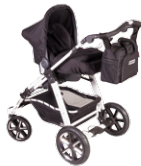
DELTA-4R + MIMMO