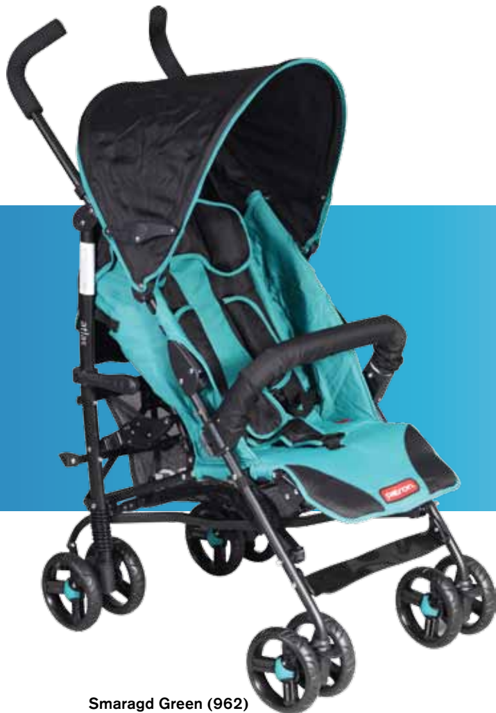
Smaragd Green (962)