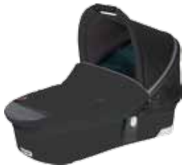
gento black (627)