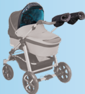
Winter accessory set (incl. winter carrycot cover addition, handlebar winter-gloves)