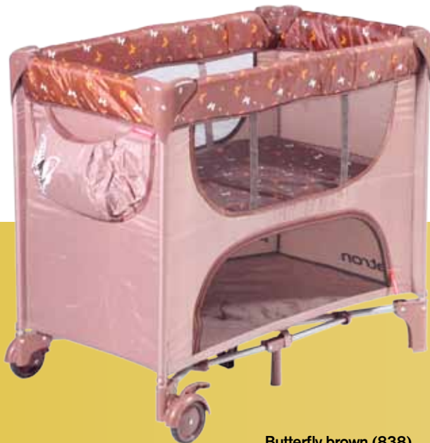
Butterfly brown (838)