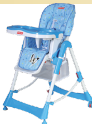
Butterfly blue (832)