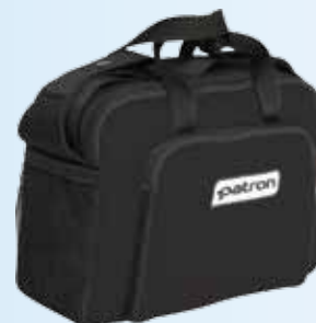
Mamabag STYLE Plus