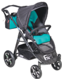
DELTA-4R + ERGO