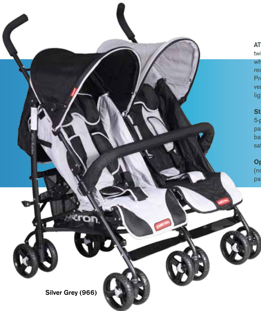
Silver Grey (966)

ATLAS Duplex is comfort type of an umbrella buggy for twins. It has full-aluminum chassis, front swivel castor-wheels with direction lock, independent backrest reclining and independently adjustable footrests. Product is suitable for in-town usage. It excels mostly in very good maneuverability, excellent folding features, light weight and rich basic equipment.