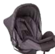
tweed stone grey (661)