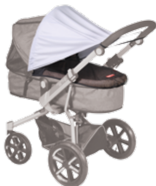
Summer accessory set (incl. summer carrycot cover addition, sun shade)