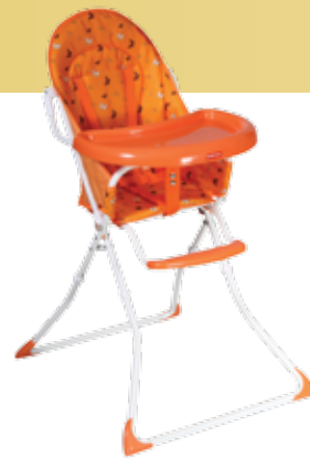
Butterfly orange (841)