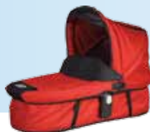
tweed ruby red (667)