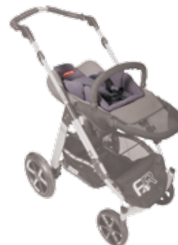
Seat sleeping inlay (ERGO)