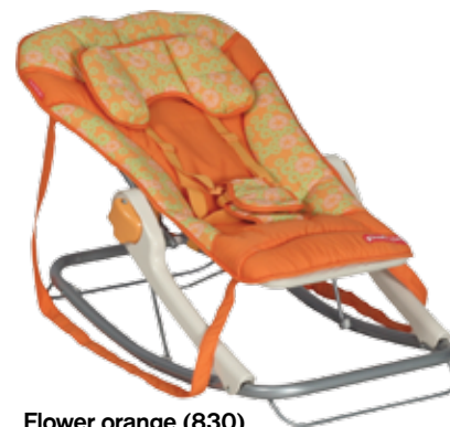
Flower orange (830)