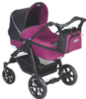
DELTA-4R + AMIGO