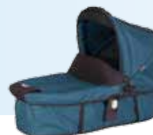
tweed teal blue (665)