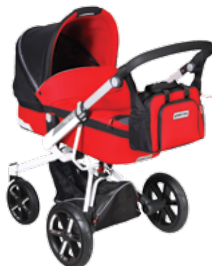
LAMBDA-4R + AMIGO