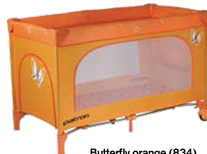
Butterfly orange (834)