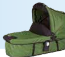
tweed pea green (666)