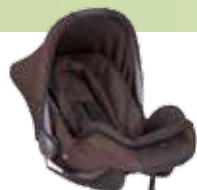
tweed bitter chocolate (670)

Product corresponds to the newest EC standards and requirements as well as has been successfully crash tested according to ECE R44/04.