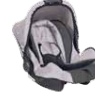
spirit silver grey (657)