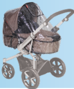
Rain cover (FIGO/VARIO)