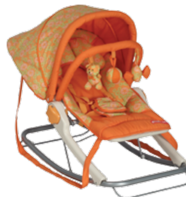
RELAX Plus with hood and toy bar

RELAX is a baby rocker with adjustable position of backrest and seat. It excels in very easy and compact folding.