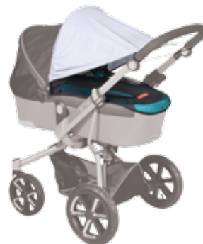
Summer accessory set (incl. summer carrycot cover addition, sun shade, pillow cotton cover)