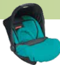
gento smaragd (634)