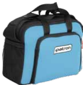
Mamabag STYLE Plus