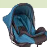
tweed pea green (666)