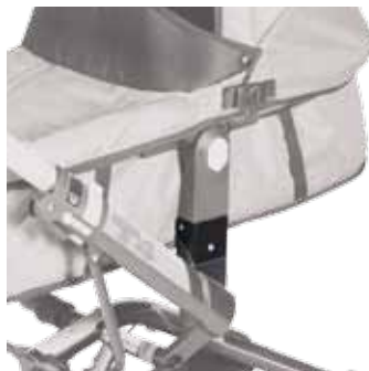
Carrycot height booster (FIGO)