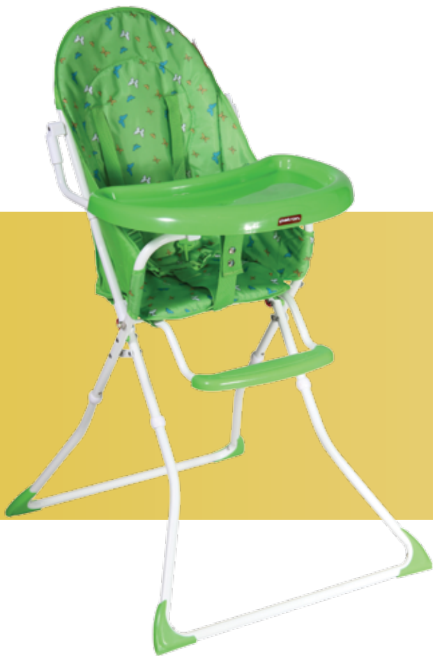
Butterfly green (840)

Baby highchair with foldaway tray. BEE excels in very light weight, compact folding, easy handling and maintenance.