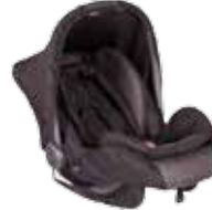
spirit black (656)