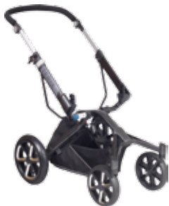
LAMBDA-4R chassis. Large front swivel wheels, compact folding, excellent handling.

Simply download web CONFIGURATOR and "assemble" your own stroller. Start with the selection of chassis - 15 basic versions for different conditions (street conditions, outdoor country, home or car access limitations, etc...). Then follow instruction to select components - more than 40 basic versions of carrycots, seat units and car seats (to achieve best care and comfort for your child). Finally you may add on practical original accessories. Additionally, through genuine "clip-A-go" components interface system you can easily and quickly change stroller function (carrycot, seat or car seat carrier). Or just buy the second chassis and gain even more great options! Simply transform your stroller from "luxury city pram" into the "off-road winter stroller". Or just keep second chassis for other activities, such a summer-house vacation, grand parents house stay, babysitter duties, etc.