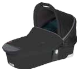
gento black (627)