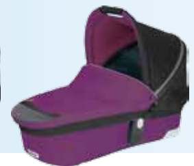
gento wine purple (629)