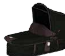
spirit black (656)