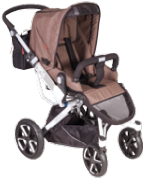
LAMBDA 4R +VARIO