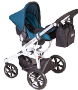
LAMBDA-4R + MIMMO