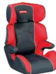
Ruby red (726)

ORION is comfortable car safety restraint of group 2 and 3, suitable for younger as well as older children from 9 to 36 kg, or to the height-limit of 150 cm. Older children can use this car seat without the backrest support.