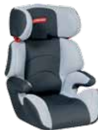
Ash grey (732)