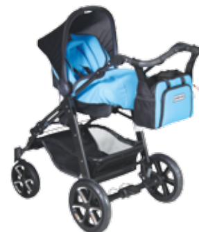
DELTA-4R + MIMMO Plus