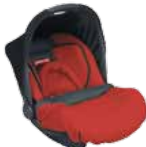
gento chilli red (628)