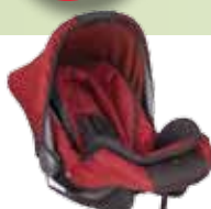
tweed ruby red (667)