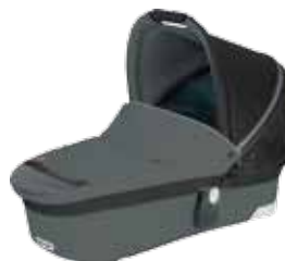
gento smoke grey (605)