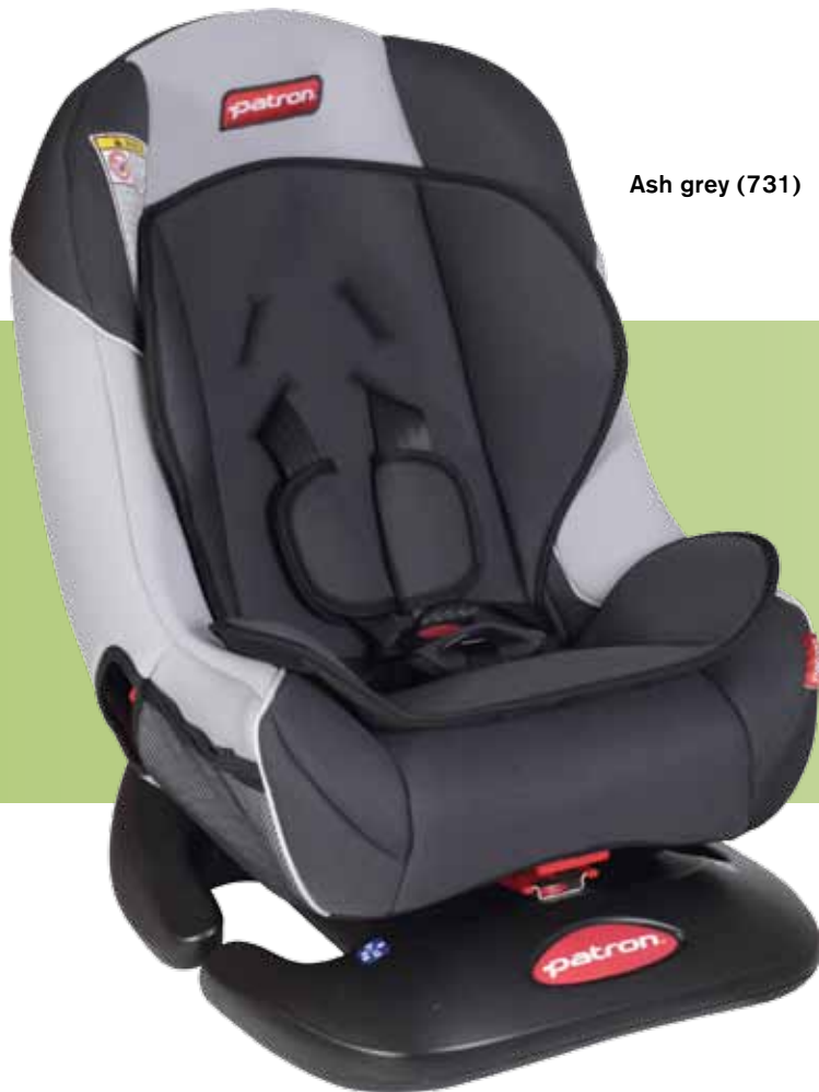
Ash grey (731)