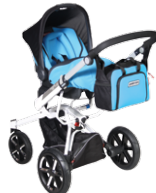
LAMBDA-4R + MIMMO Plus