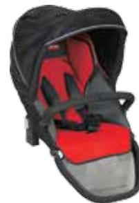
ERGO seat unit. ergonomical backrest contour, extended side protection.