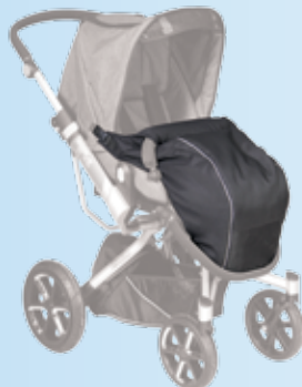
Winter foot-muff (VARIO)