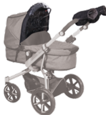
Winter accessory set (incl. winter carrycot cover addition, handlebar winter-gloves)