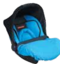
gento turquoise (604)