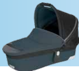
gento graphite (672)