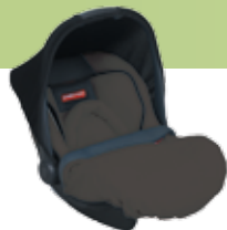
gento bitter chocolate (671)