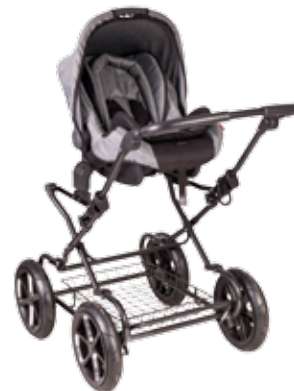
TYPO + MIMMO

mamabag STYLE Plus, Summer accessory set (incl. summer carrycot cover addition, sun shade), Winter accessory set (incl. winter carrycot cover addition, handlebar winter-gloves), winter baby nest for AMIGO/ FIGO carrycot, raincover for FIGO and MIMMO, parasol, „clip-A-go" interface for other baby car seats (MAXI COSI, CYBEX, BESAFE, etc...), LED lights, mini air-pump, cup holder .