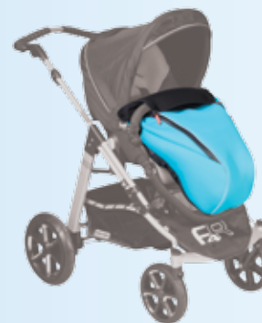
Winter foot-muff (ERGO)