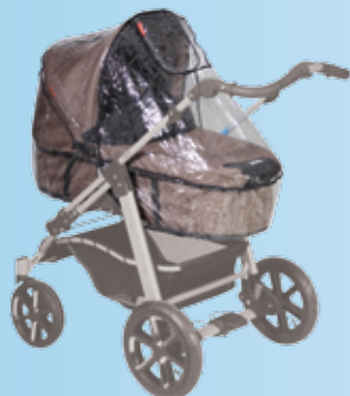
Rain cover (VARIO / FIGO)