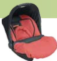
gento salmon (649)