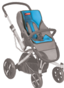
Seat inlay for small children (ERGO)