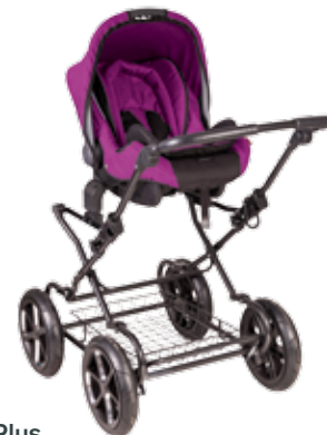
TYPO + MIMMO Plus

mamabag STYLE Plus, Summer accessory set (incl. summer carrycot cover addition, sun shade, pillow cotton cover), Winter accessory set (incl. winter carrycot cover addition, handlebar winter-gloves), winter baby nest for AMIGO/FIGO carrycot, handy-case STYLE for AMIGO, raincover for AMIGO and MIMMO Plus, parasol, „clip-A-go” interface for other baby car seats (MAXI COSI, CYBEX, BESAFE, etc...), LED lights, mini air-pump, cup holder .