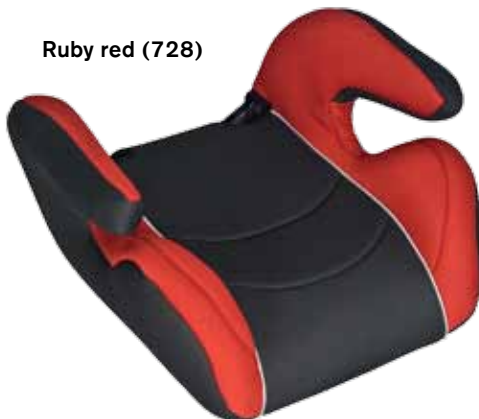
Ruby red (728)

MAX is comfortable ergonomic car seat – booster of group 3, equipped with easy detachable cover and suitable for children from 15 to 36 kg.