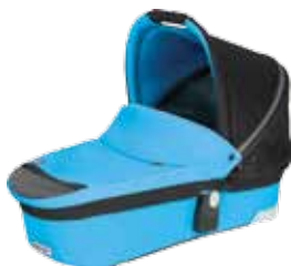
gento turquoise (604)