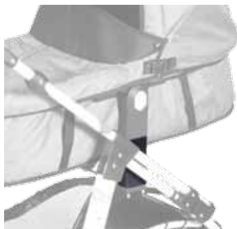
Carrycot height booster (FIGO)