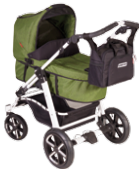
DELTA-4R + FIGO