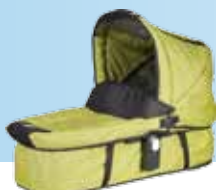
tweed lime (669)