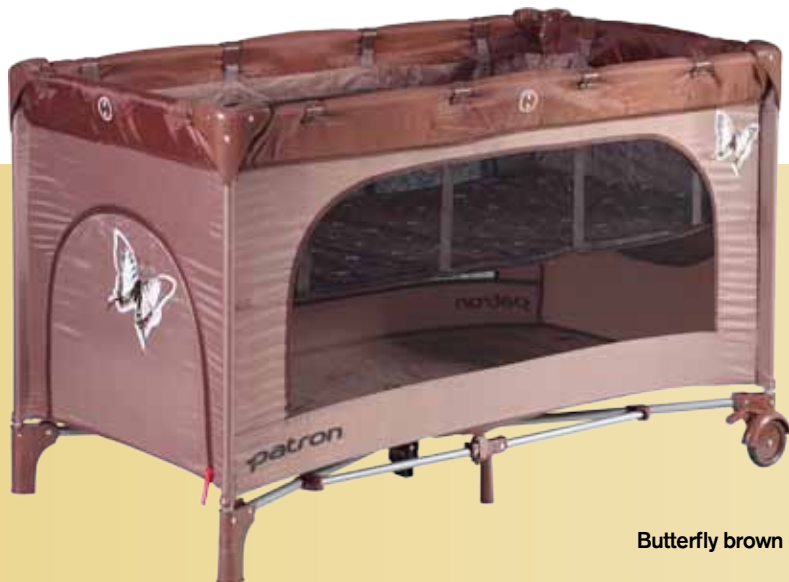
Butterfly brown (835)