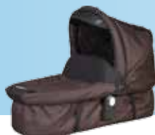
tweed bitter chocolate (670)