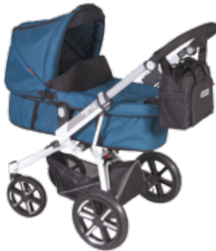
LAMBDA-4R + FIGO