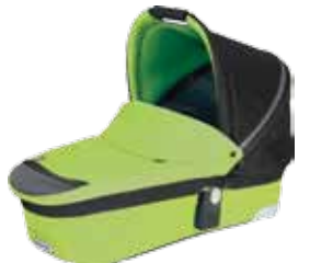
gento kiwi (602)