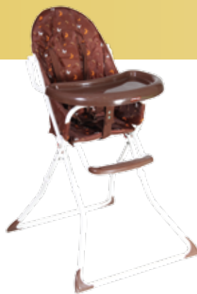
Butterfly brown (842)

washable seat cover, foldaway dining tray, 5-point safety harness