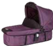
tweed bordeaux (664)