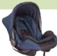
tweed indigo blue (668)