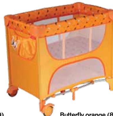
Butterfly orange (837)