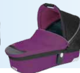
gento wine purple (629)