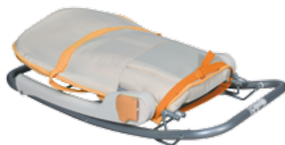
Folded baby rocker

Option RELAX Plus also includes canopy and toy bar.