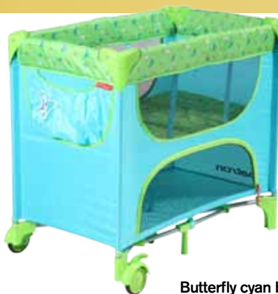
Butterfly cyan blue (839)