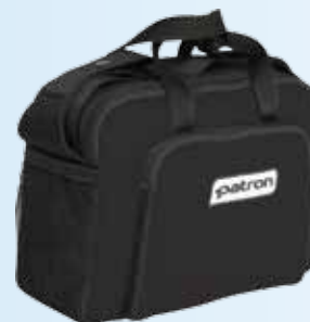
Mamabag STYLE Plus