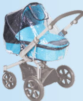
Rain cover (ERGO / AMIGO)