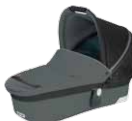
gento smoke grey (605)