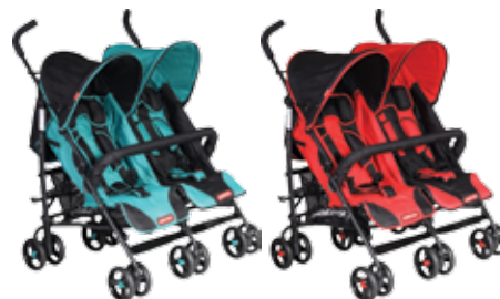
Smaragd Green (965) Ruby Red (964)

(not included in standard equipment): parasol, rain cover, cup holder