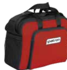
Mamadbag STYLE Plus. Suitable for LAMBDA, DELTA and TYPO chassis.