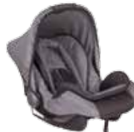
tweed smoke grey (662)