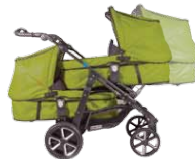
chassis with unique SPEX-function

Upholstery patterns are identical with FENIX travel system, see page 21.