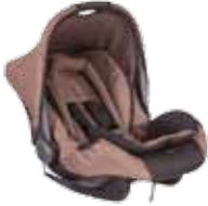
tweed tabasco brown (663)