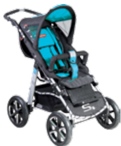
spirit cyan blue (632)