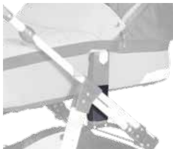
Carrycot height booster (AMIGO)