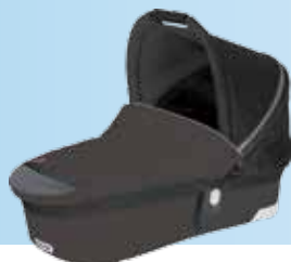
gento bitter chocolate (671)