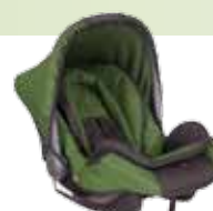
tweed teal blue (665)