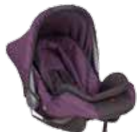
tweed bordeaux (664)