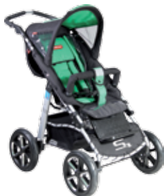
spirit grass green (631)