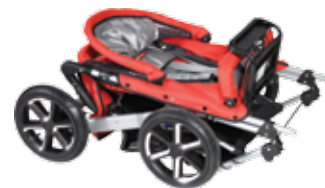
backrest recline adjustment