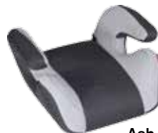
Ash grey (733)