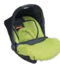
gento kiwi (602)