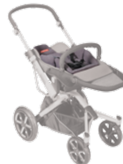
Seat sleeping inlay (ERGO)