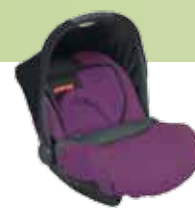
gento wine purple (629)