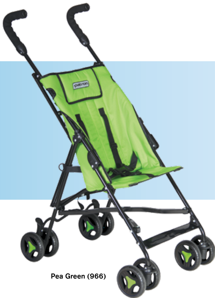
Pea Green (966)