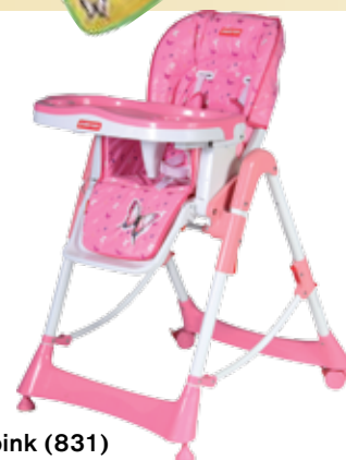
Butterfly pink (831)