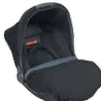
gento black (627)