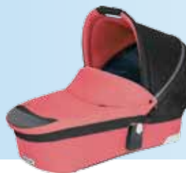
gento salmon (649)